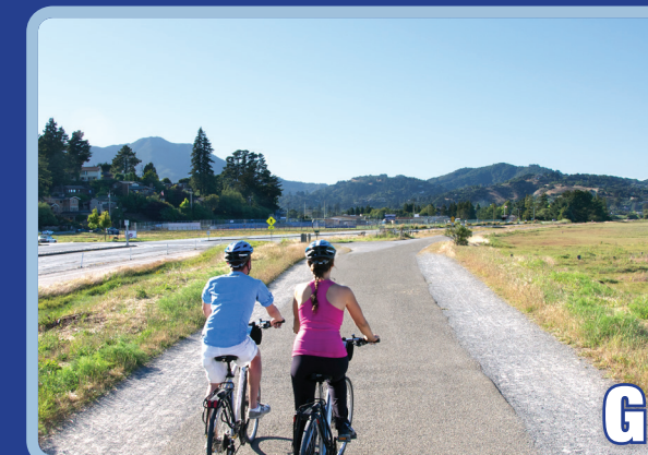
Mill Valley Bike Path