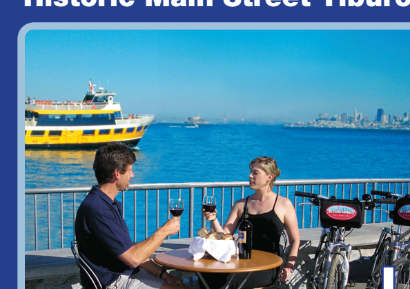
Return Via Ferry!