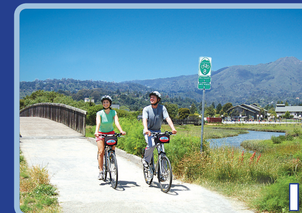
Bike Route #8