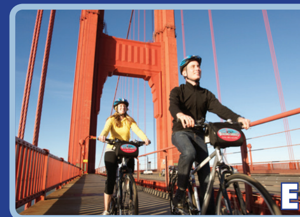
Bike the Bridge!