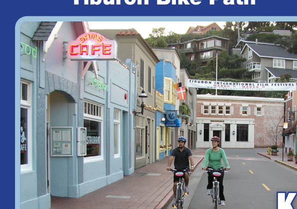
Historic Main Street Tiburon