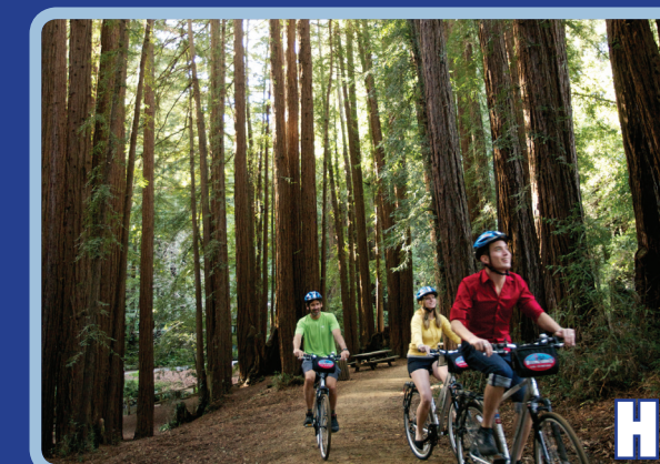
Old Mill Park - Tallest Trees!