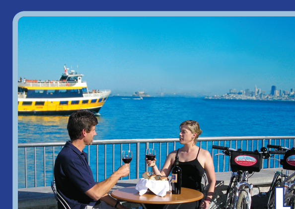
Return Via Ferry!