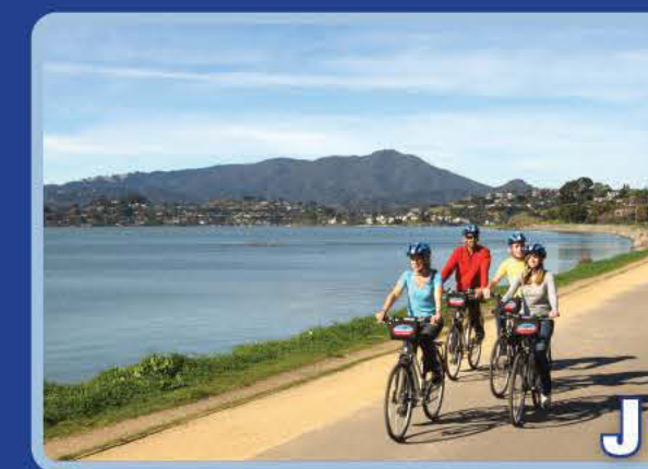
Tiburon Bike Path