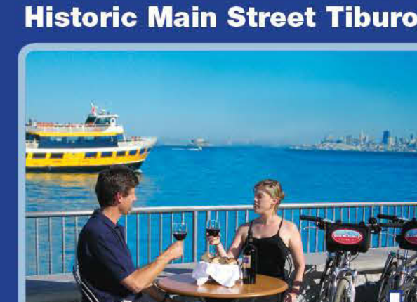
Return Via Ferry!