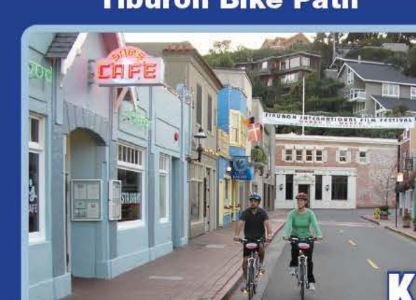
Historic Main Street Tiburon