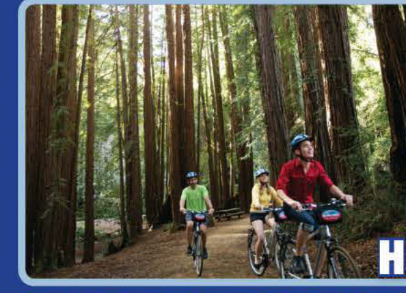
Old Mill Park - Tallest Trees!