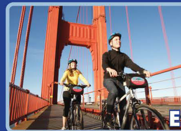
Bike the Bridge!