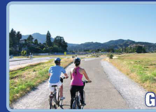
Mill Valley Bike Path